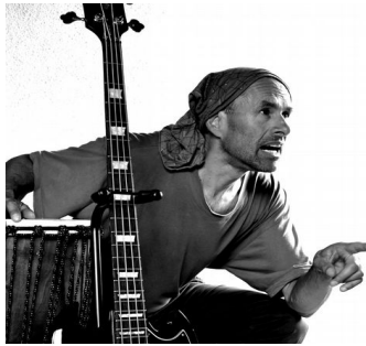
Editor of this newsletter in his routine 'non-verbal aspects of communication'