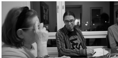
Committee working on problem solving capabilities